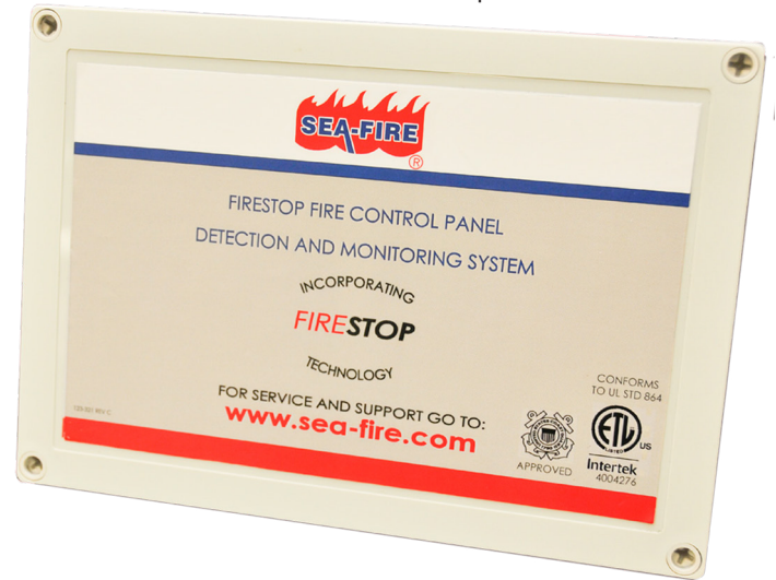
131-501 FireStop Fire Control Panel